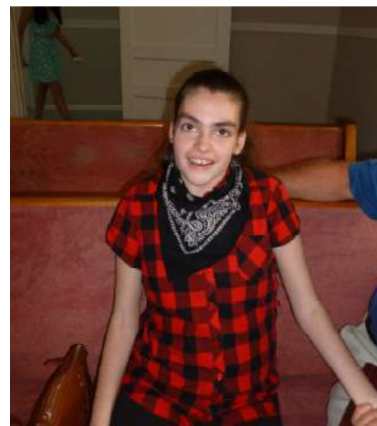
Our Special Needs Member will make your day with her big smile!!!