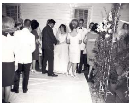
Receiving line was outside in front of the building.