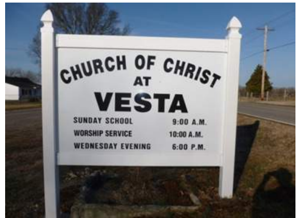
This is the Vesta Church of Christ as it is today (2015)