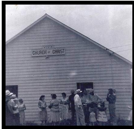
Earliest known photo of the church.—This was the building built in 1936 after a storm blew the previous building away.

We would welcome others who might have photos and/or memories they would like to share. Please send that information to s.whittle1@tds.net .